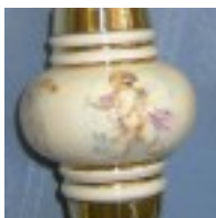
CERAMIC WITH CUPIDS