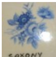
CERAMIC With Blue Saxony