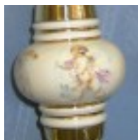
CERAMIC WITH CUPIDS