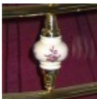
CERAMIC With Glamis Rose