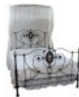
HALF TESTER or 4 POSTER PARTS