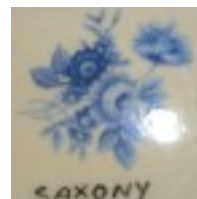
CERAMIC With Blue Saxony