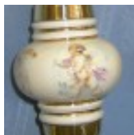
CERAMIC WITH CUPIDS