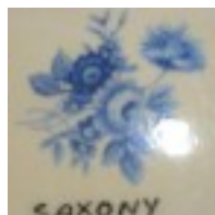
CERAMIC With Blue Saxony