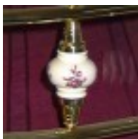
CERAMIC With Glamis Rose