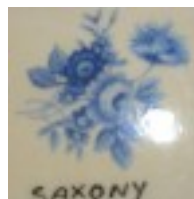
CERAMIC With Blue Saxony