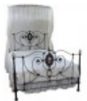
HALF TESTER or 4 POSTER PARTS