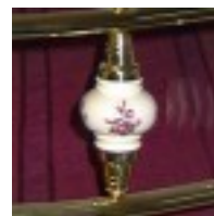
CERAMIC With Glamis Rose