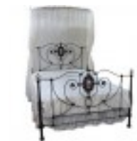
HALF TESTER or 4 POSTER PARTS