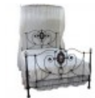
HALF TESTER or 4 POSTER PARTS