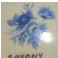
CERAMIC With Blue Saxony