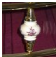
CERAMIC With Glamis Rose