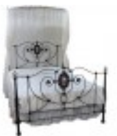
HALF TESTER or 4 POSTER PARTS