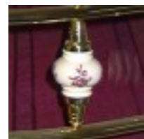
CERAMIC With Glamis Rose