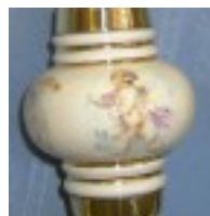
CERAMIC WITH CUPIDS